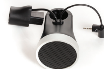
Audio Kit (Sold Separately)