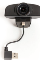
Camera Kit (Sold Separately)